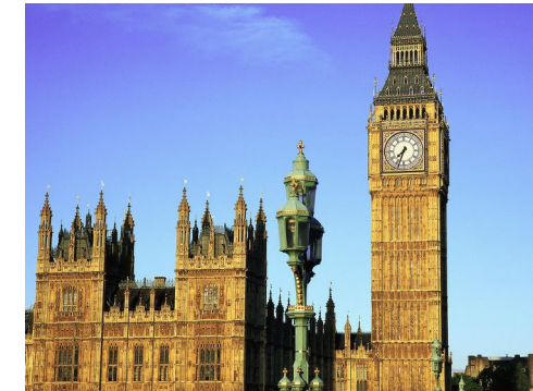
The Houses of Parliament in London