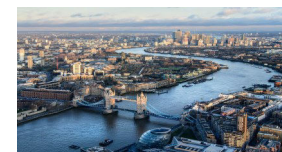
River Thames in London