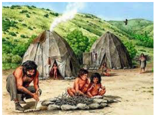
A stone age village

We will learn about farming techniques used and how tools changed in the different ages.