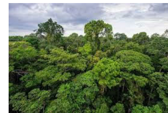
Rainforest (The Amazon)