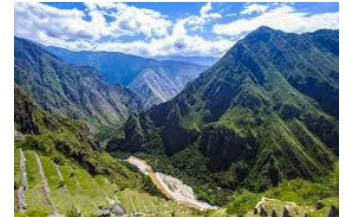
Mountains (Andes Range)