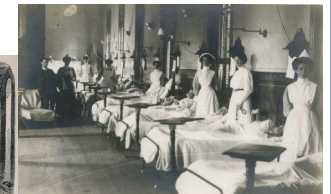
WW1 War hospital