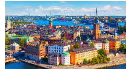
Stockholm—the capital city of Sweden