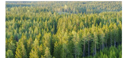
About 70% of Sweden is covered by forests.