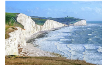
The Seven Sisters chalk cliffs in East Sussex.