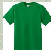
Earth house Green