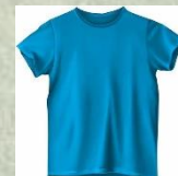
Water house Blue