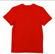
Fire house Red

We would love the children to wear their house team colours to their Sports Day if they would like to. If they do not want to wear their house colours, they can wear their normal PE kits on this day.