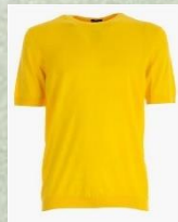
Air house Yellow