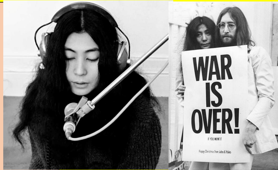
CAW Significant Figure of the Week