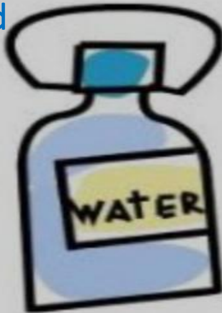
Named Water Bottle