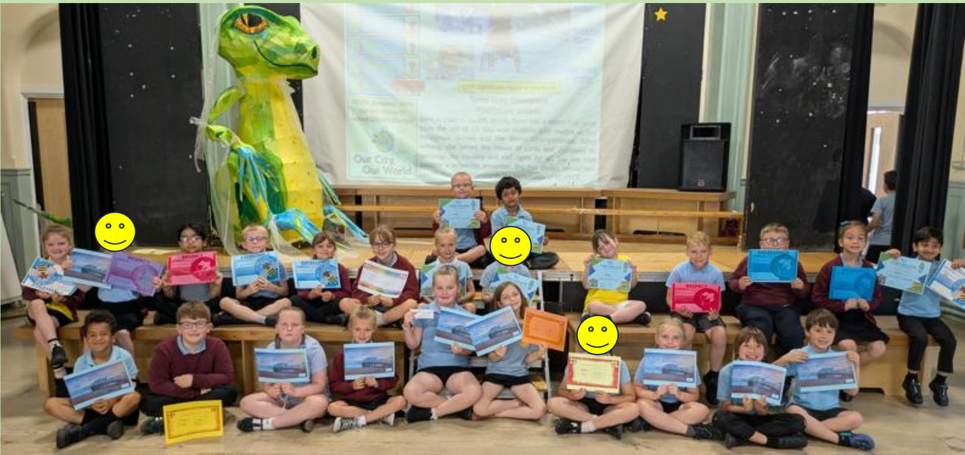
Certificate winners from Monday's assemblies!