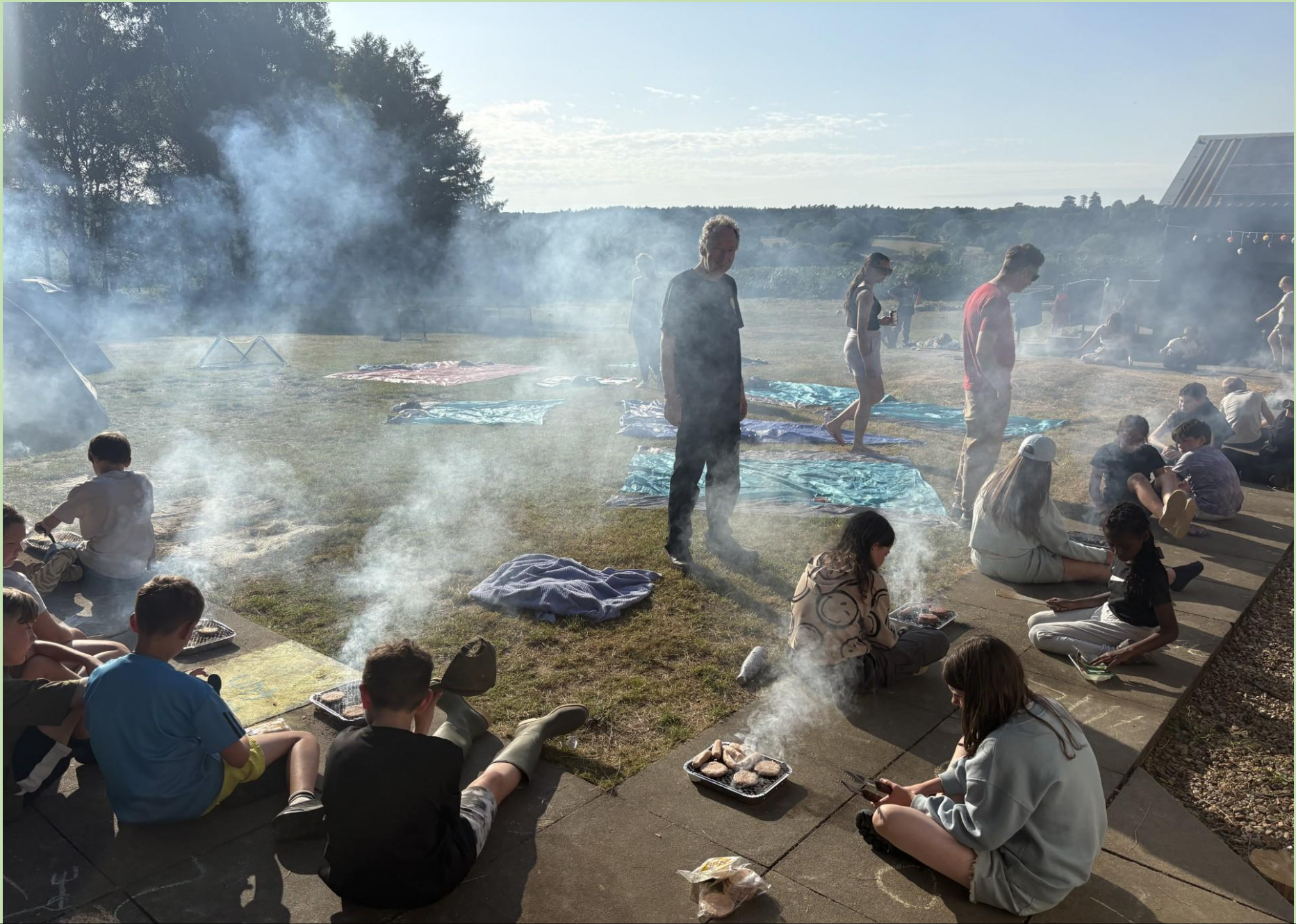
Year Six cooking their own dinner at their Residential!