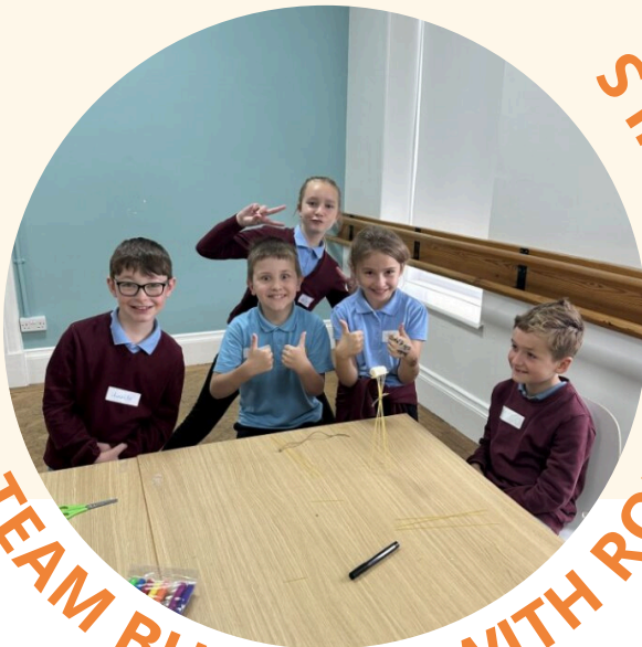
TEAM BUILDING WITH ROEDEAN PUPILS