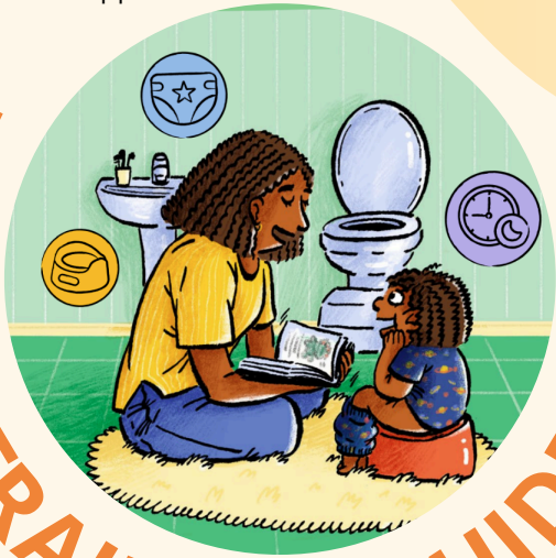
TOILET TRAINING GUIDE